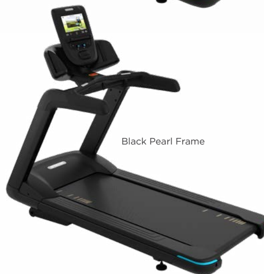
Black Pearl Frame