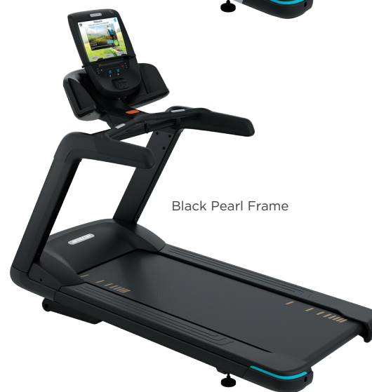
Black Pearl Frame