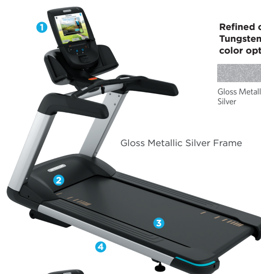
Gloss Metallic Silver Frame