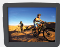
P10 Console with optional 15" Personal Viewing System