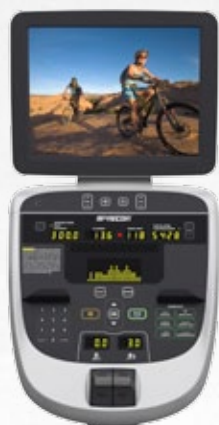
P30 Console with optional 15" Personal Viewing System