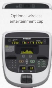
Optional wireless entertainment cap