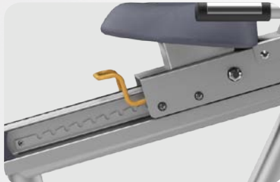
Aluminum seat rail