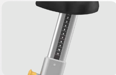
Aluminum seat post