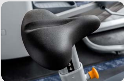
New, improved saddle